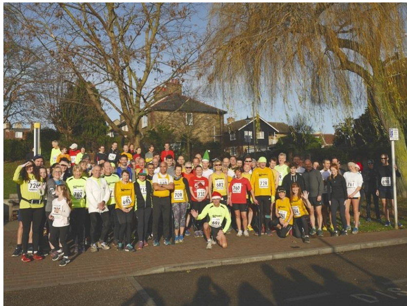
Cabbage Patch 4 group at start